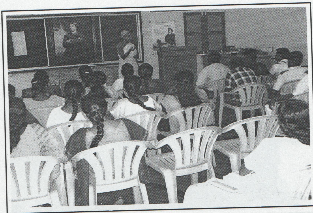
Sis. V. Saraswathi explaining the importance of Nursery and tree plantation