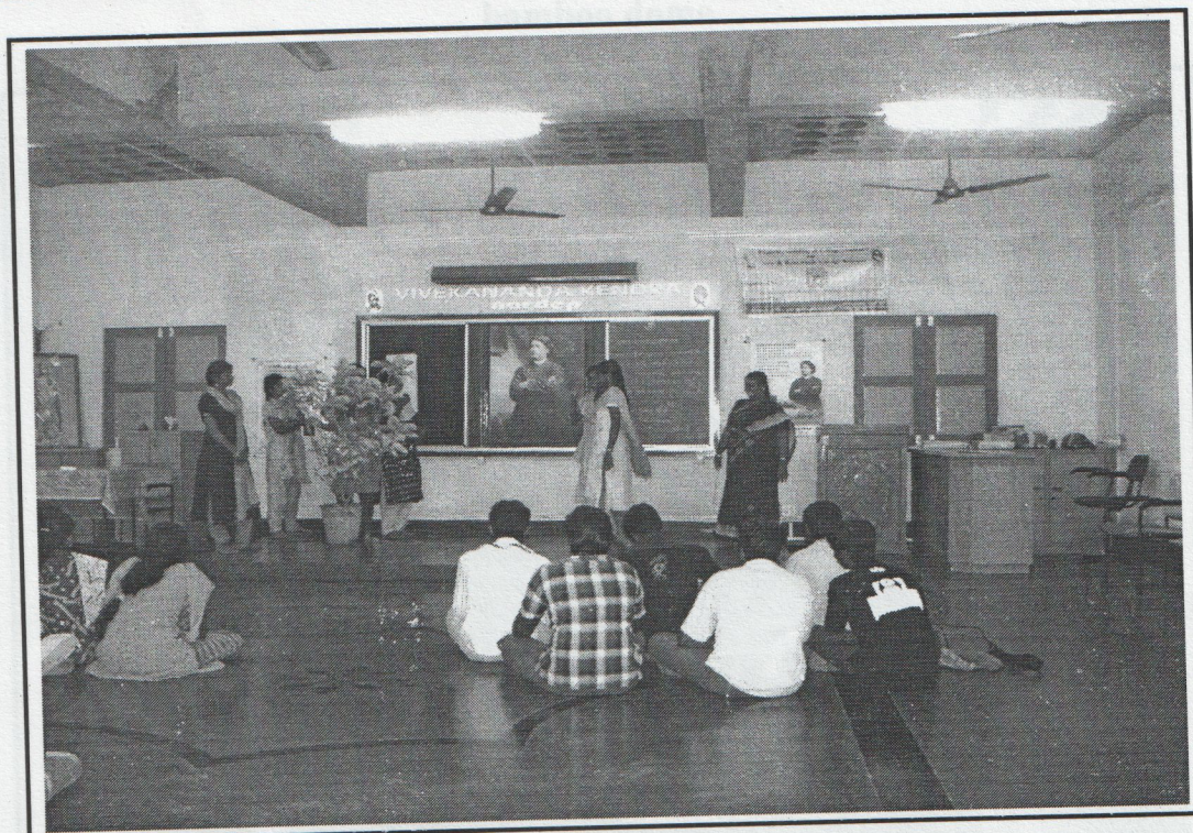
Street play based on "Environment in day today life"

Smt. Raghav explaining the use of biogas slurry in vermi compost