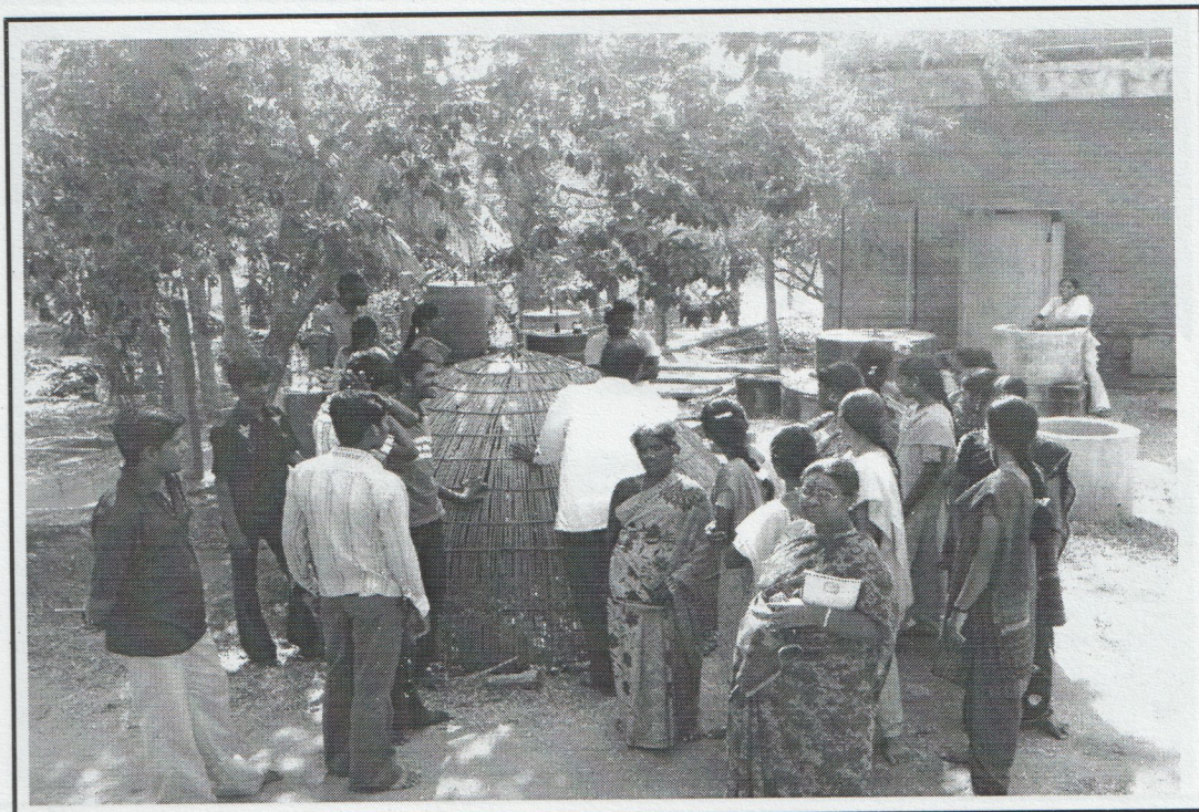
Participants observing the various models of biogas plant including a bamboo dome