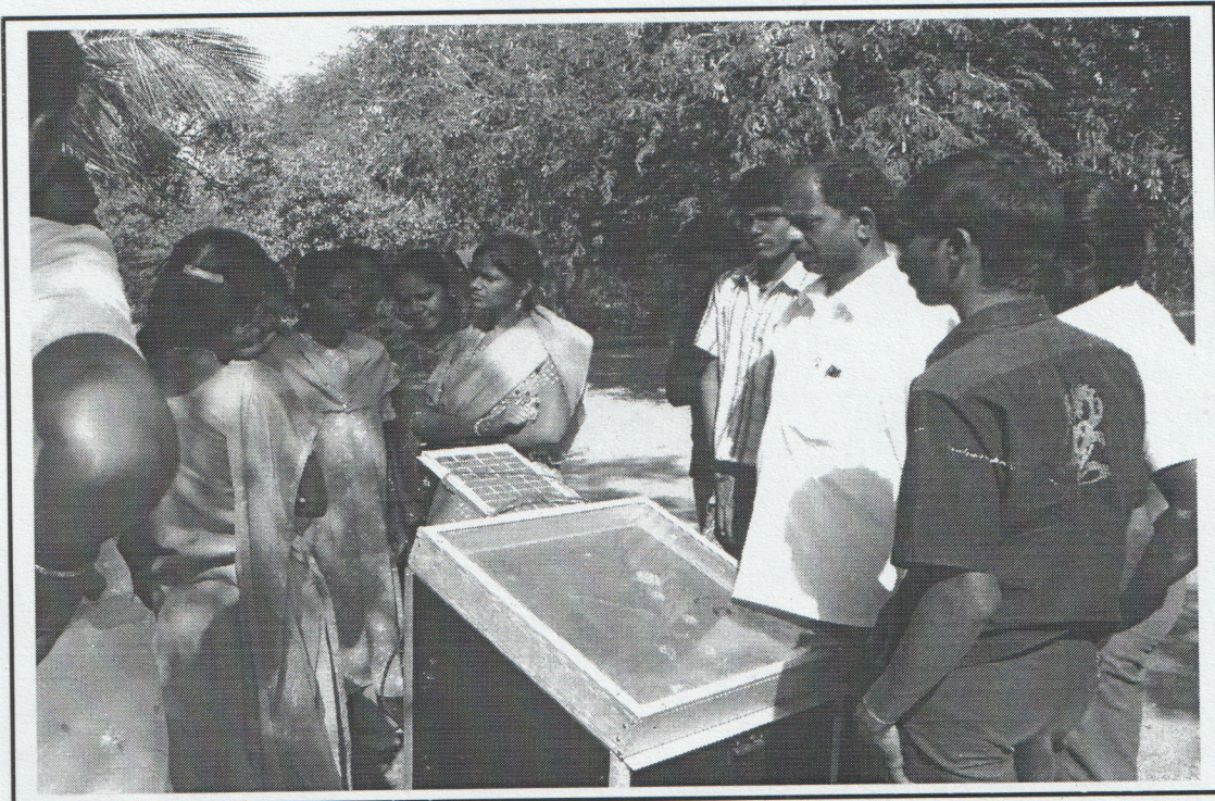
Solar drier a novelty for the college students