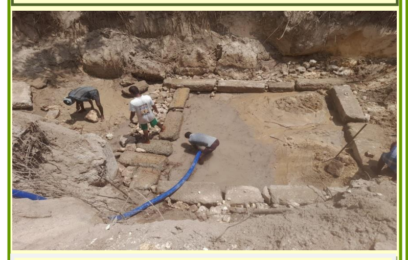
Dewatering the area for proper construction of foundation

Revival and Renovation work of Teppakulam at Rameswaram is in the final stages. The project was sponsored by CSR wing of Murugappa Educational and Medical Foundation, Chennai.