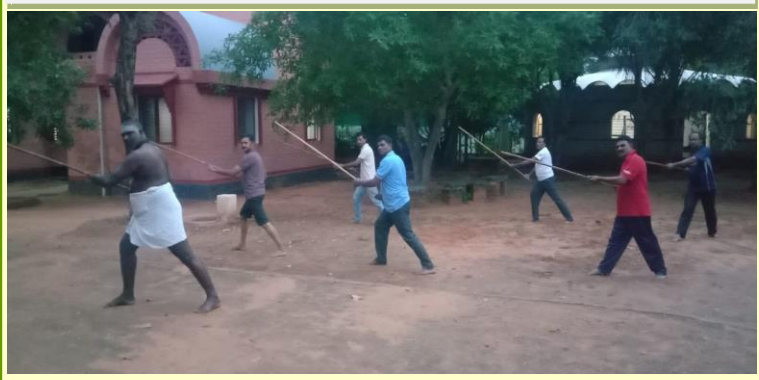
Interested participants attended Varma silambam