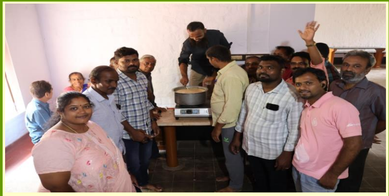
Medicine preparation is on...