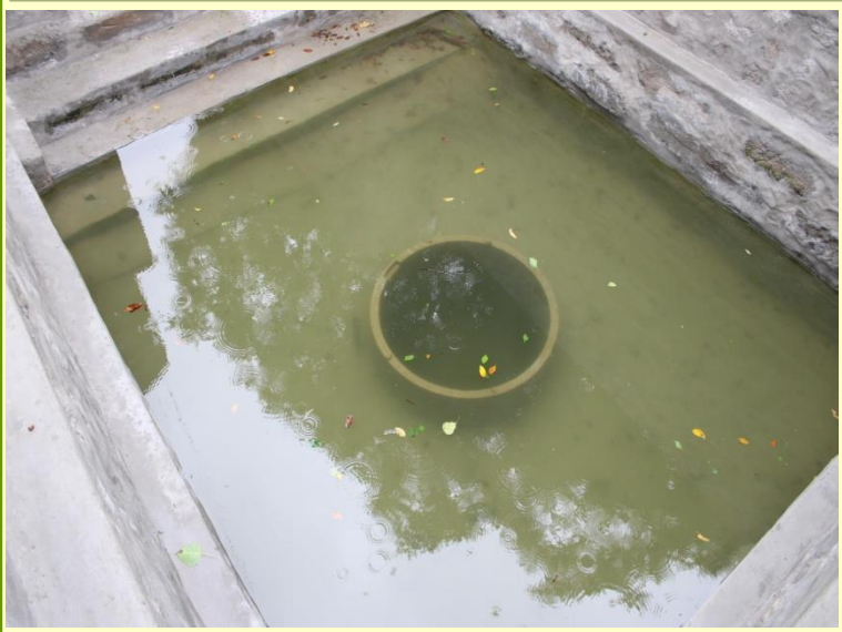
Ring well at the center for getting water in an emergency