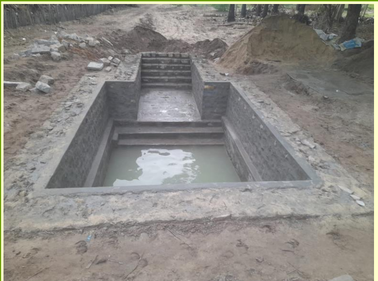
Final shape of Teppakulam