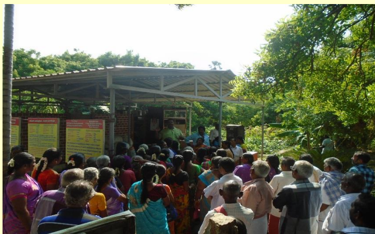
Participants at J.C.Bose Nursery

200 member of Dist. Watershed Development Agency, Virudhunagar visited Gramodaya Park and J.C.Bose Nursery on 10 th May as a part of Field visit. Participants learned Water management technologies.