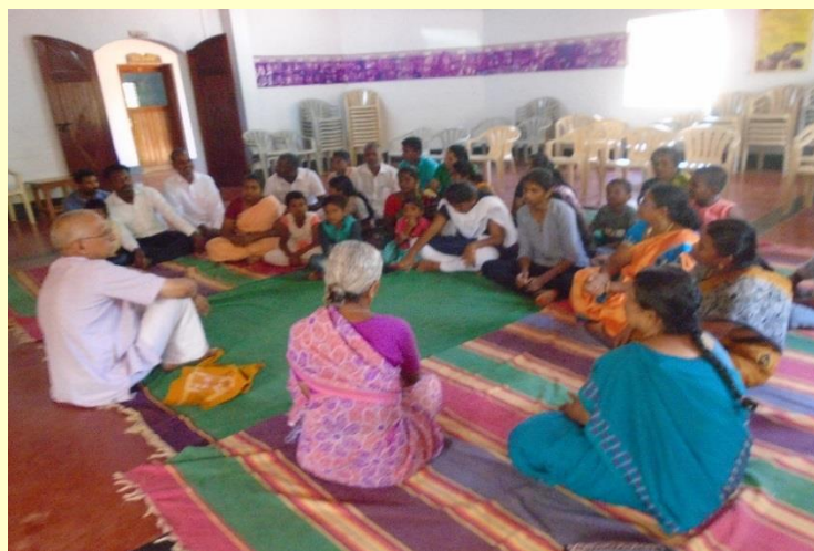
Group discussion is on ... during family camp