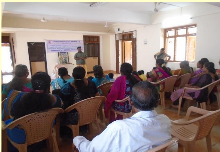
Session is on ...