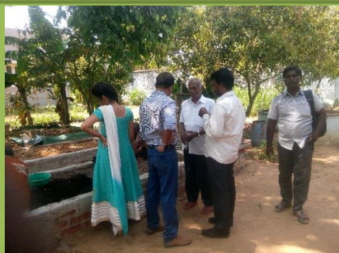
Camp participants at J.C.Bose nursery

Training programme on "Organic farming" was held at J.C.Bose Nursery on 3 rd March. 05 farmers attended the training. Shri.S.Rajamony was the resource person.