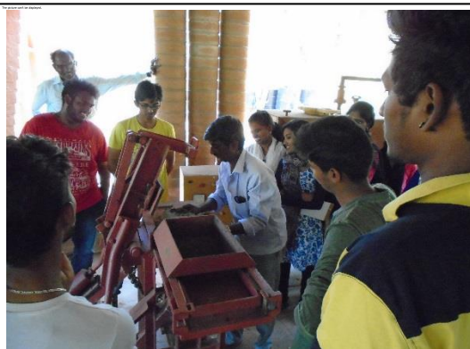
Practical demonstration - Mud block making