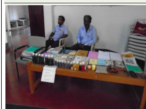
Exhibition of books, publications, herbal cosmetics, tools etc.