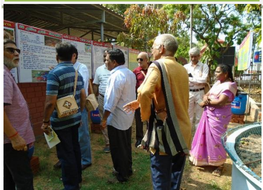
Team at J.C.Bose Nursery