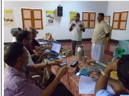
Biogas user sharing his experience