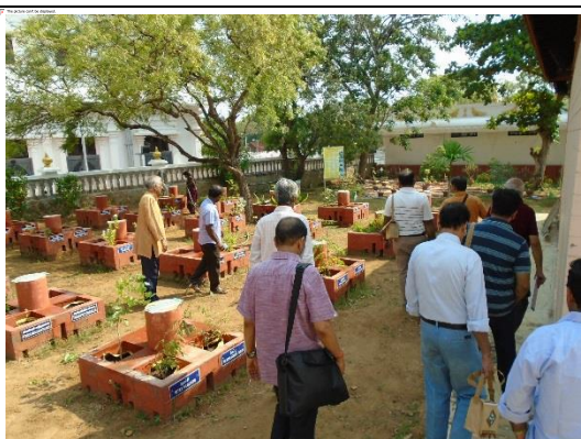
Expert team at Gramodaya park Herbs for Healing