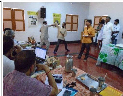
Kalari performance is on at TRC