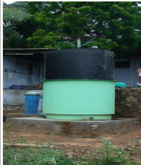
6 cum portable type Bio-methanation plant

Portable type 6 cum - 1 no. 0.5 cum - 24 nos.