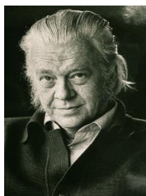
E.F. Schumacher German statistician and famous economist for his book – 'Small is Beautiful'