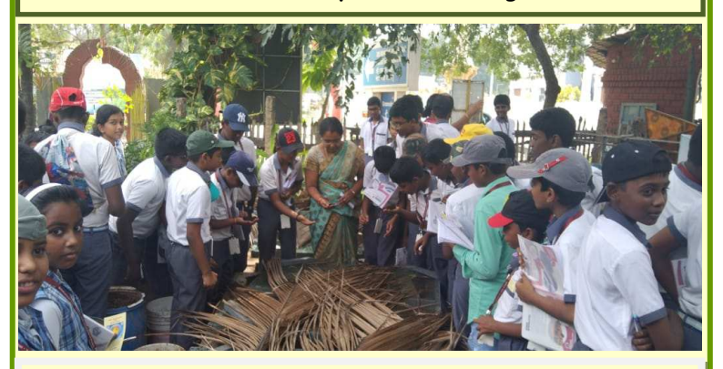
Students holding earthworms in their hands for the first time

120 students from Shelffield Innovative School, Nagercoil visited Gramodaya Park and J.C.Bose Nursery on 19<sup>th</sup> November as a part of a study tour. Students learned Sustainable Development technologies.