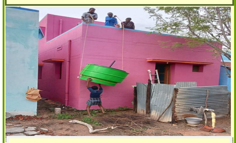
Lifting the plant to terrace for commissioning

20 nos. of 1 cum Shakti Surabhi portable Biomethanation plants were commissioned at Thattankudiruppu, Ramanathapuram District in the month of November. The programme was sponsored by BrahMos Aerospace, New Delhi.