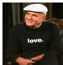
Dr. Wayne W. Dyer Extracts from the book "Pulling your own Strings"

Instead, wake up and appreciate everything you encounter along your path. Enjoy the flowers that are there for your pleasure, tune in to the sunrise, the little children, the laughter the rain and the birds. Drink it all in rather than waiting to get to some always future point where it will be all right for you to relax.