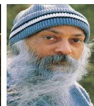
Acharya Rajanish Extracts from the book "Random Thoughts"

Thought is a sign not of knowledge but of ignorance. Knowledge is a state of thoughtlessness. It is not thinking. It is insight. The garments of thoughts cover up more and more. We have to strip them off and see ourselves completely nude. No learning but unlearning, No dressing, but disrobing is required to know the self. When the guests of thought from outside have left, only then is known, the one that is not the guest but the host.