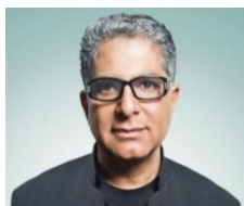
Deepak Chopra Indian-American author and alternative medicine advocate

If the colony splits then shortage of young workers, so oldies become young.