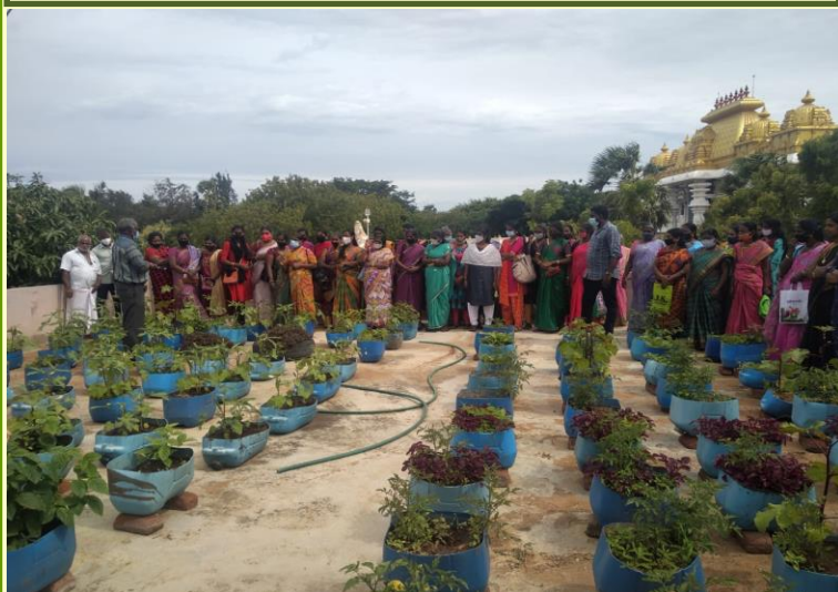
Participants at our terrace garden

40 ATMA farmers from Tiruvattar block of Kanyakumari district visited our J.C.Bose Nursery on 18 th August as a part of exposure visit. The programme was sponsored by Dept. of Agriculture, Kanyakumari Dist.