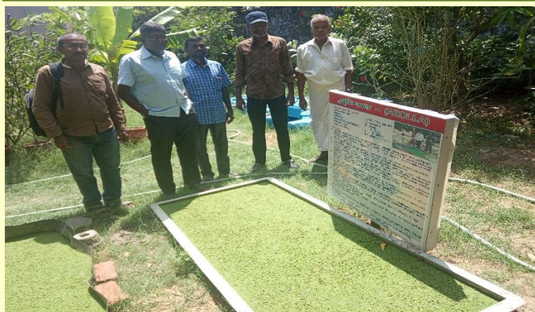
Camp participants standing near the Azolla bed