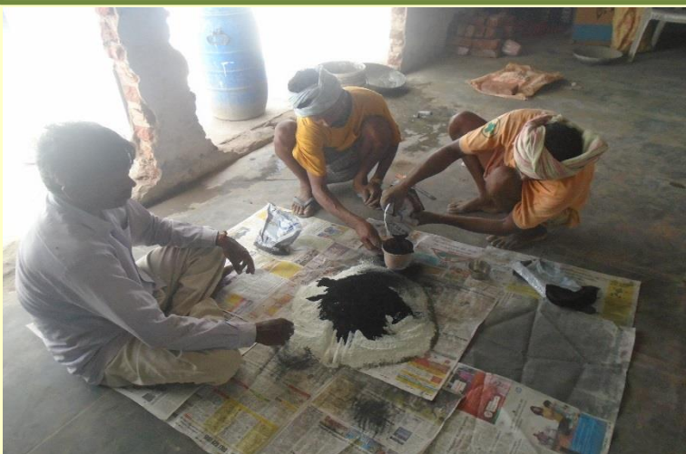
Preparing the mixture before starting the Traditional floor work