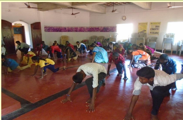
Participants doing Yogasana exercises