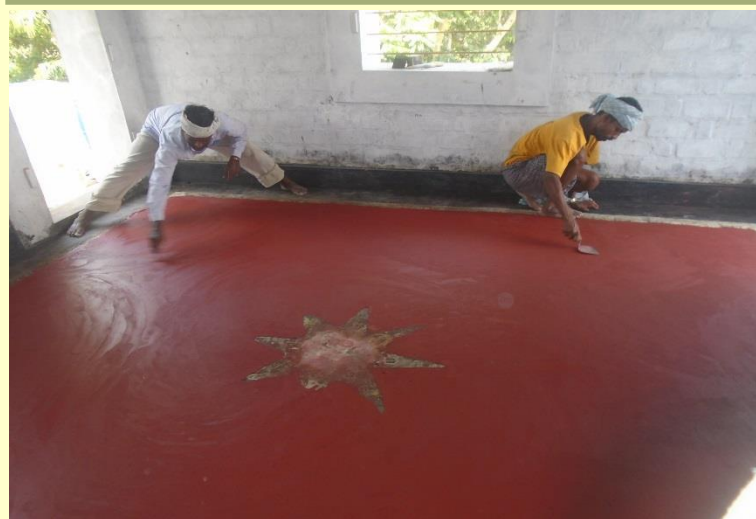
Masons at work - Traditional Floor making

Green health home worked for 4 days and treated 194 patients.