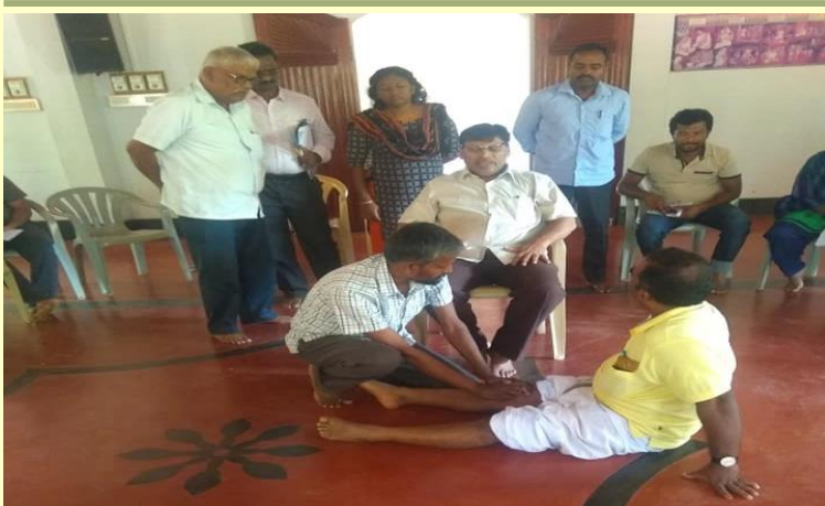
Practical demonstration is on .....