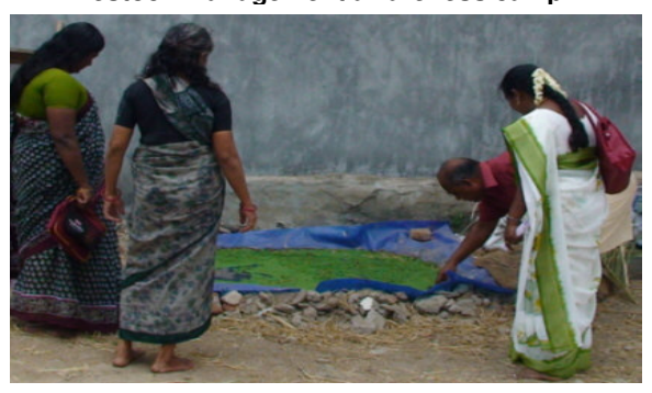
Livestock Management Awareness