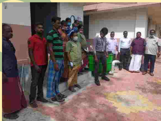
Resource Recovery Park, Pottayadi, Mylaudy Town Panchayat - Bio-methanation plant based on kitchen waste