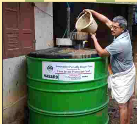
Stakeholder pouring the waste in the Bio-methanation plant - project supported by NABARD, Chennai