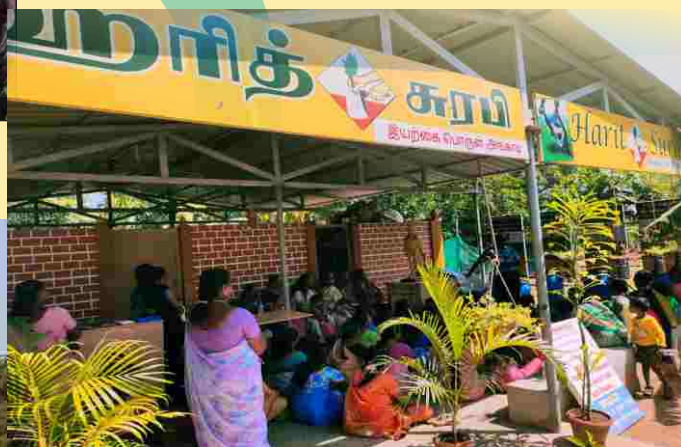
Visit to Harit Surabhi shop