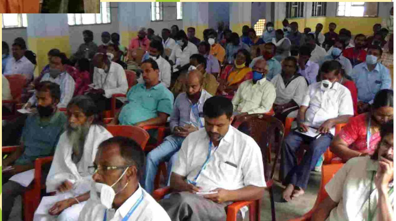
Attentive audience during the seminar