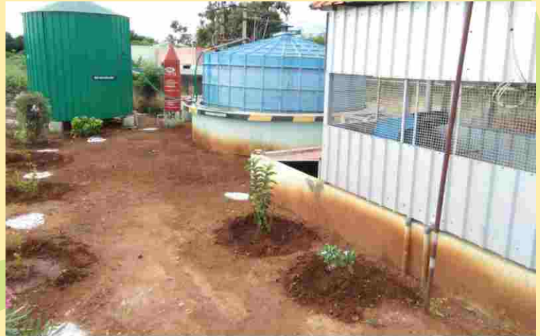
THENI DISTRICT – UTHAMAPALAYAM TOWN PANCHAYAT SOLID WASTE MANAGEMENT – BIO METHANATION PLANT

The plant remained idle for 2 – 3 months. Neither the original vendor was coming for the check up and repairs nor other vendors working in the field of Biogas could solve the problem. Finally, VK-Nardep sent their supervisor who was working in the field at Pollachi at that time.