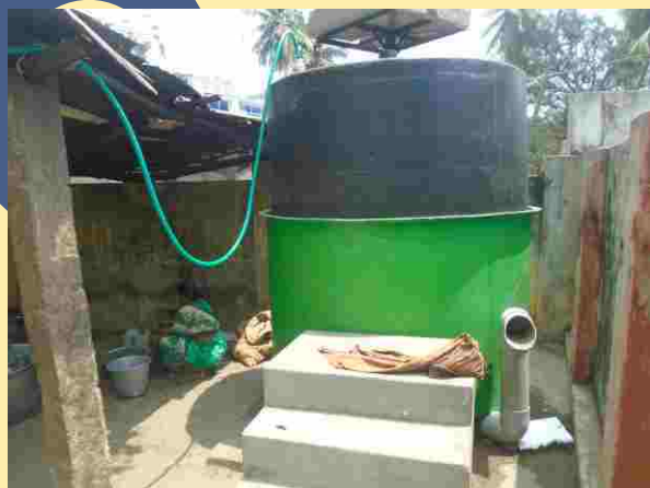
6cum portable plant installed at School in Rameswaram

Installation of Shakti Surabhi Bio-Methanation plants -16 nos.