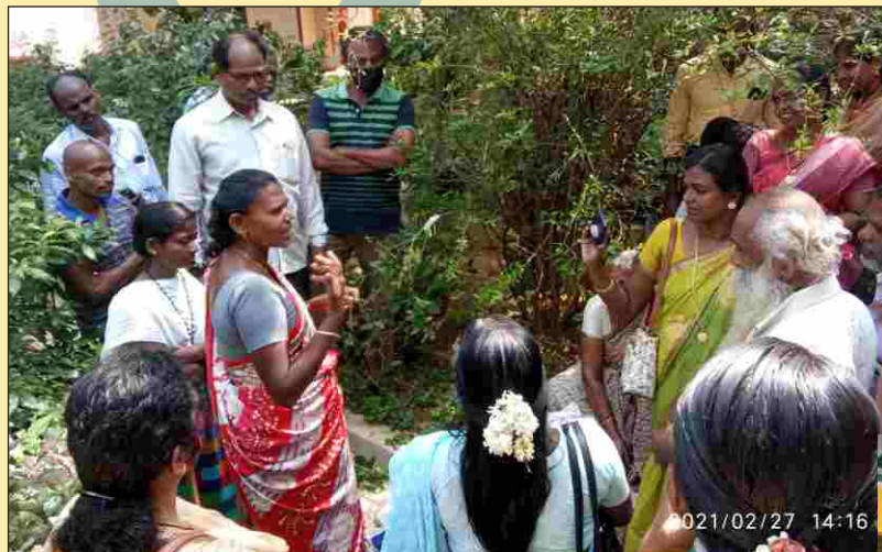
field visit to our nursery