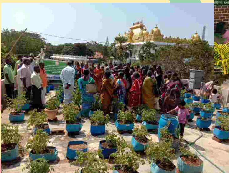
terrace garden in Vivekanandapuram