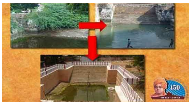
Hanuman Teertham Now: From pollution to Purity

Swami Vivekananda's 150 th birth anniversary celebrations are making ecological footprints in the sands of Rameshwaram. Even as the work on Hanuman Teertham and Draupadi Teertham are progressing wonderfully, the work at Sahadeva Teertham has been taken up by Kendra. This is the third teertham that is getting renovated