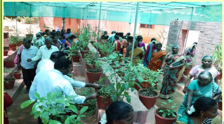
Established plants greeting the stakeholders in the Mother nursery with a shed net