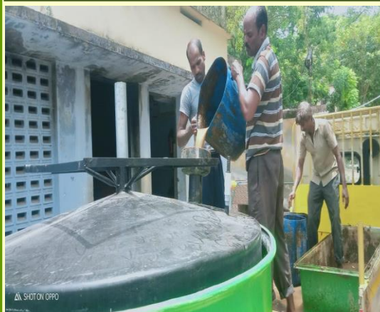
Initial pouring of cow dung slurry in the plant for the formation of bacterial colony

In the month of September, One number of 6 cum Bio-methanation plant (Portable) commissioned at Thovalai Block of Kanyakumari Dist.