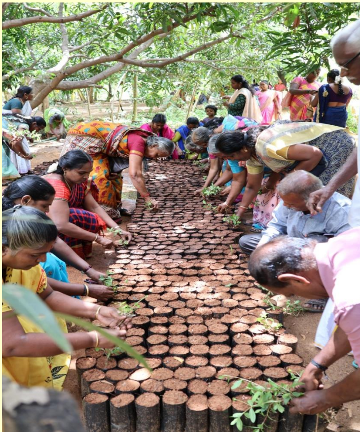
Hands on training - planting the material in the grow bags