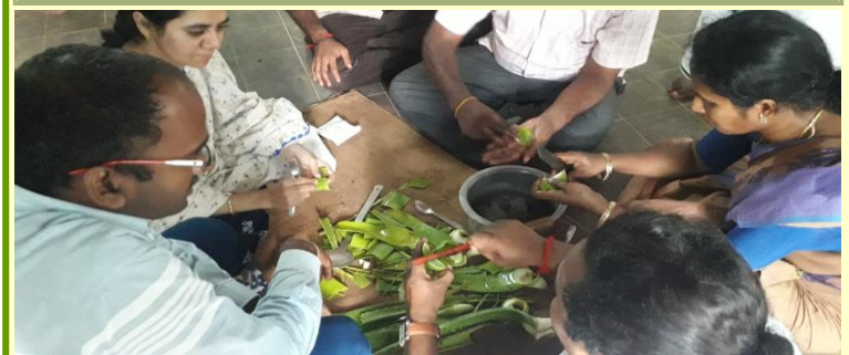
Medicine preparation is on...