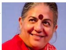
Dr. Vandana Shiva Director, Navadanya, New Delhi

Already in some cases, we have lost forever a treasure of knowledge materially enclosed in bio-diversity and in diverse cultural traditions. Diversity of languages is important in the context of diversity of human cultures. Eliminating linguistic diversity has prevented the maintenance and transmission of traditional knowledge from one generation to another. Languages are the vehicles of knowledge. Their disappearance is the disappearance of imagination.