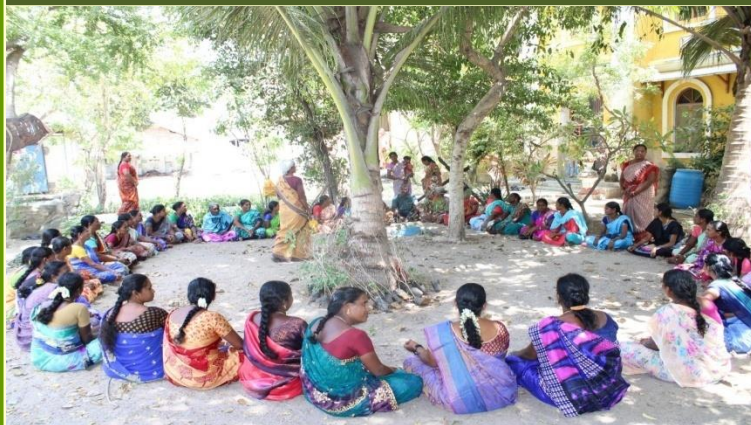
Stakeholders undergoing training in tune with Nature

1 st batch of 5 days Training Programme on "Harit Aajeevika" was held at Rameswaram from 19 th to 23 rd September. 59 participants attended the programme. L&T Technology Services, Bangalore, sponsored the programme.