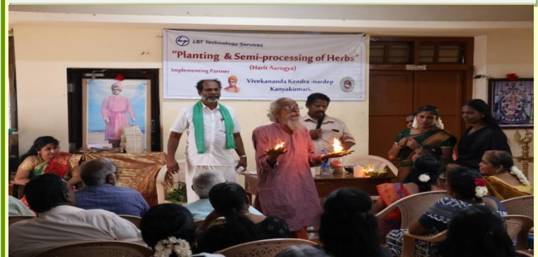
Magic show? Nay the science behind herbal plants